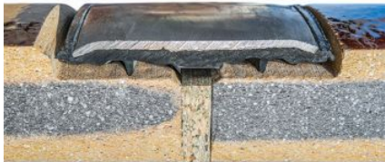
Joint type 1